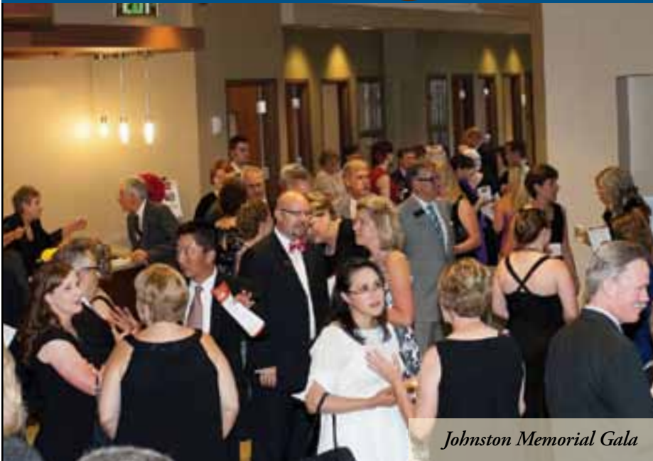
Johnston Memorial Gala