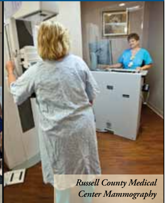
Russell County Medical Center Mammography