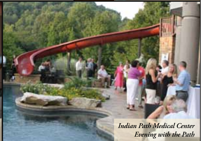
Indian Path Medical Center Evening with the Path