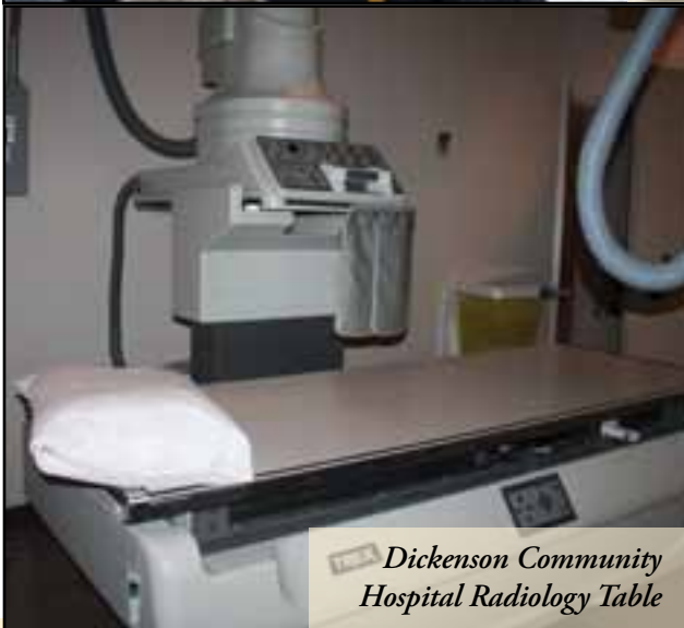
Dickenson Community Hospital Radiology Table